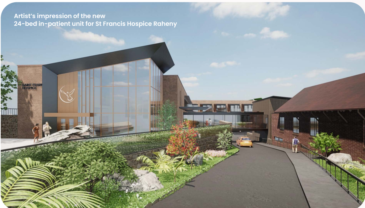
Artist's impression of the new 24-bed in-patient unit for St Francis Hospice Raheny